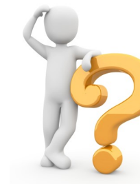
Exhibit Hall Scavenger Hunt

During the conference there will be several opportunities for students to meet with other audiologists to have an open forum to ask questions or learn about other VAs across the nation.